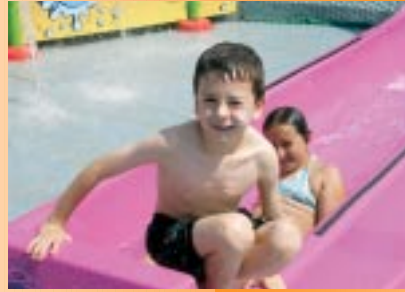
Smiling all the way

week 9# Mon _____ Tue _____ Wed _____ Thur _____ Fri _____