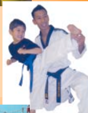
Helping students be their best