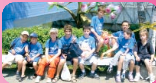
Educational outing to Ontario Place