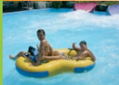
Just floating around